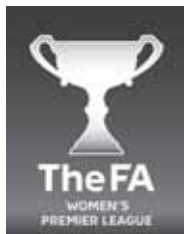
Table & today's fixtures